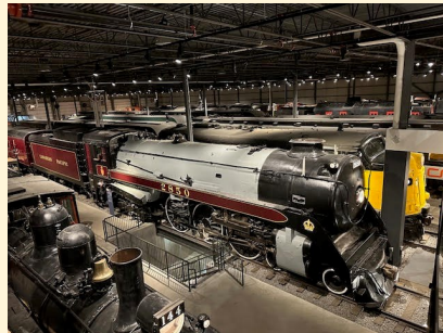
EXPO RAIL Train museum, Montreal, Quebec, Canada.