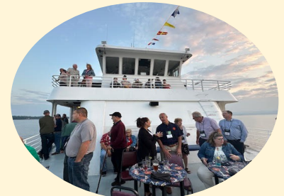
Dinner Cruise on Lake Champlain with our fellow TCA Convention attendees.