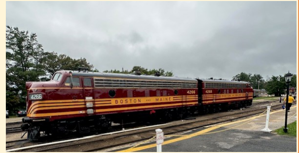
Beautiful F-Unit pair at the Conway Scenic RR.