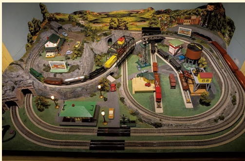
American Flyer Layout at the Shelburne Museum in Burlington, Vermont.