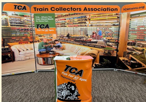
Poster made from pictures of an actual train collection of a TCA Member. This was on display in the convention trading hall.