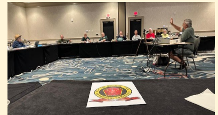
TCA National Board meeting at the 2023 Convention in Burlington, VT.