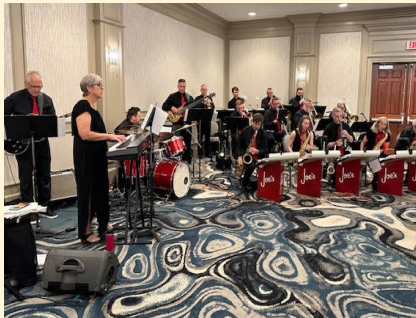
16 piece band at the welcoming dinner.