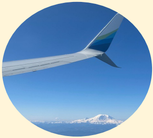
Flying by Mt. Rainier with Mt. Adams in the distance.