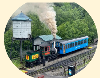
Our Steam Cog Railway train on Mt Washington getting water for our trip up.