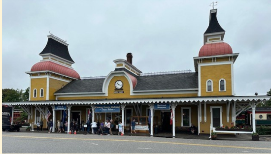
Conway Scenic Railway station.