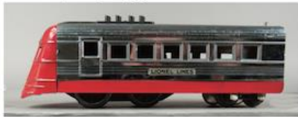
No. 1700E fluted chrome body; front and frame painted red, Outfit No. 1065E.

Lionel's smallest streamline diesel locomotive from the 1930s was offered in a delightful range of finishes and three different catalogue numbers, Nos. 1700, 1700E and 1816. Bill Faust brought four versions of the locomotive, each with their outfits, to be photographed at York.