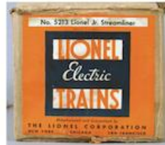
Box end label, Outfit No. 5213. The outfit included No. 1700, described above. The outfit also included two matching passenger cars.