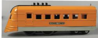
No. 1700 with body and front painted Hiawatha orange, frame painted gray, Outfit No. 5213.