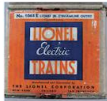
Box end label, Outfit 1065E which included 1700E, described above. The outfit included two matching passenger cars.