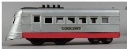
No. 1700E, Outfit No. 6202E. Body and front painted aluminum, frame painted red..