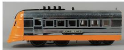
No. 1816 windup locomotive, Outfit 1535; fluted chromed body, front and frame painted orange. Lionel describes the outfit as a mechanical train. See box below.